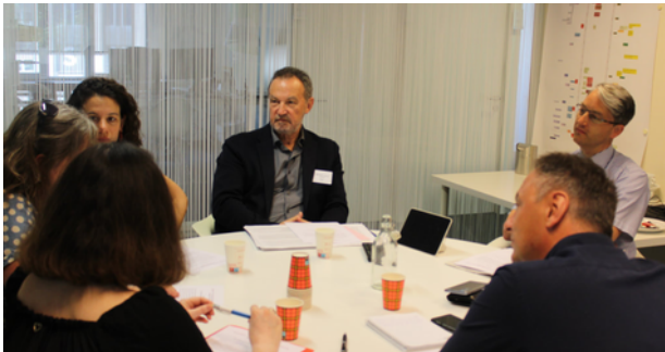
Case studies allowed for smaller and more focused discussions between practitioners

The participants made the most of the session by delving deeper into the procedural differences between their respective EU MSs, which allowed them to foster a deeper understanding of the subject.